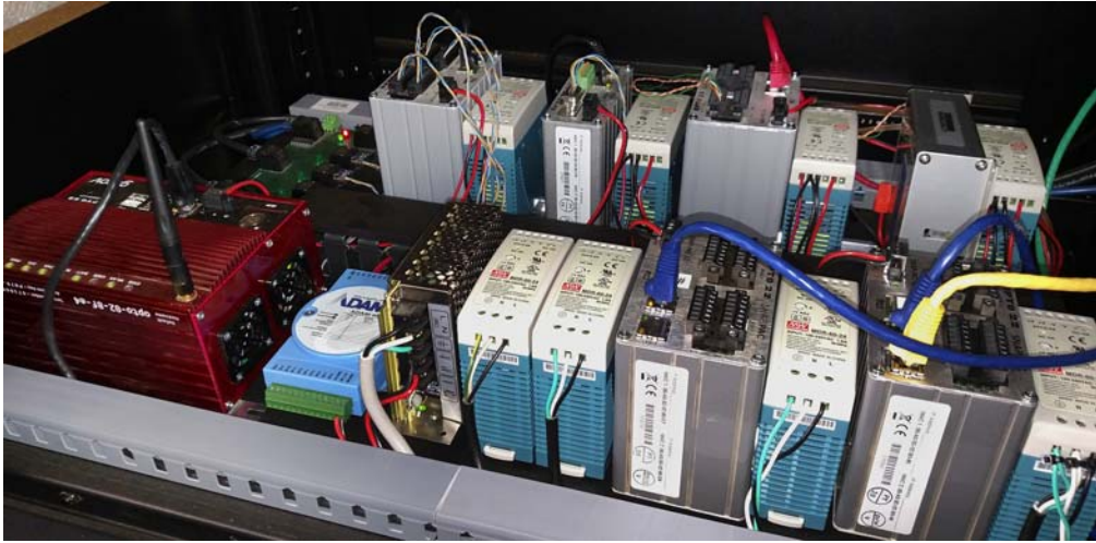
The Opto 22-based WindCapture system allows SCADA Solutions to quickly scale back power generation during periods of low demand.

personal phone, how they can monitor and control their wind turbines from anywhere.”